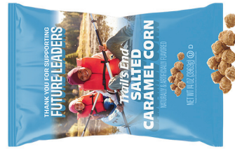
SALTED CARAMEL CORN $25