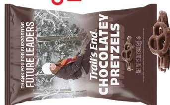
CHOCOLATEY PRETZELS $30