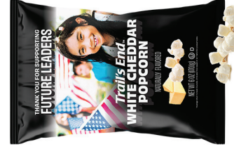
WHITE CHEDDAR POPCORN $20