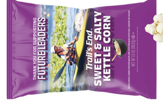
SWEET & SALTY KETTLE CORN $15