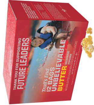
UNBELIEVABLE BUTTER MICROWAVE POPCORN $25