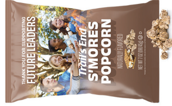
S'MORES POPCORN $30